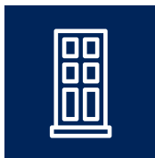
Entrances and Exits