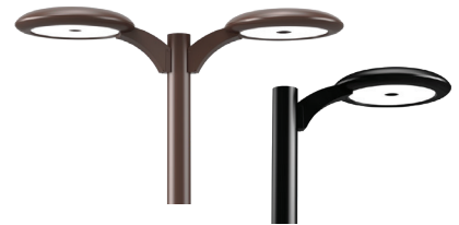
Side Arm Mount for Poles

Contact Your RAB Design Lighting Sales Rep Today!