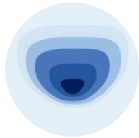
Wide 75°, 6 × 6