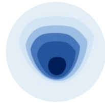
Medium Wide 55°, 5 × 5*