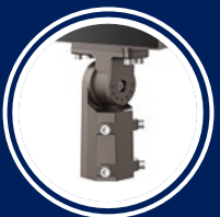
Slip Fit Mount