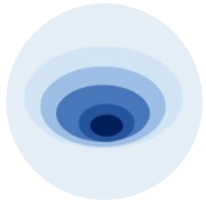
Extra Wide 90°, 7 × 6

Field-adjustable optics. No need to change optics. Enables contractors to adjust light patterns in the field.