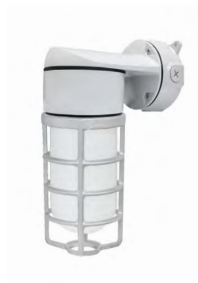
DVBKSX-LED14 shown with GD100CGS Cast Guard and GL100F Frosted Glass.