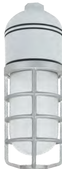
DVCSX-LED14 shown with GD100CGS Cast Guard and GL100F Frosted Glass.