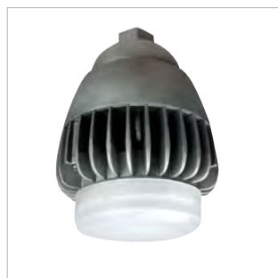
DVCS2-LED Pendant mount