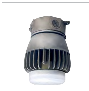
DVAKS2-LED Ceiling mount