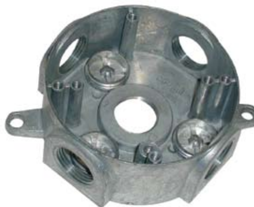
ZINC NATURAL FINISH