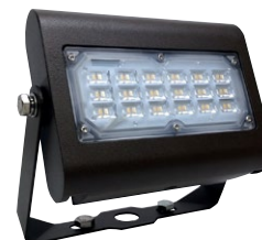
FL2-LED30 with Yoke Mount