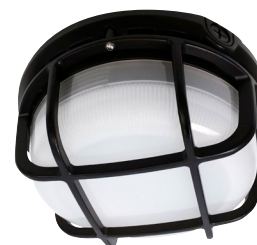
CLB2-LED40 with Wire guard