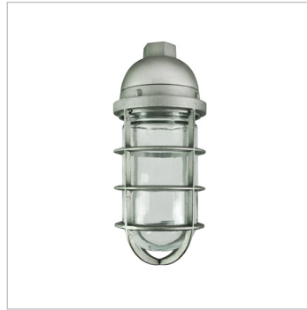
DVCS100CG Pendant mount