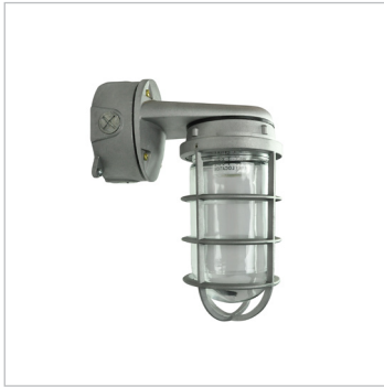
DVBKS100CG Wall mount