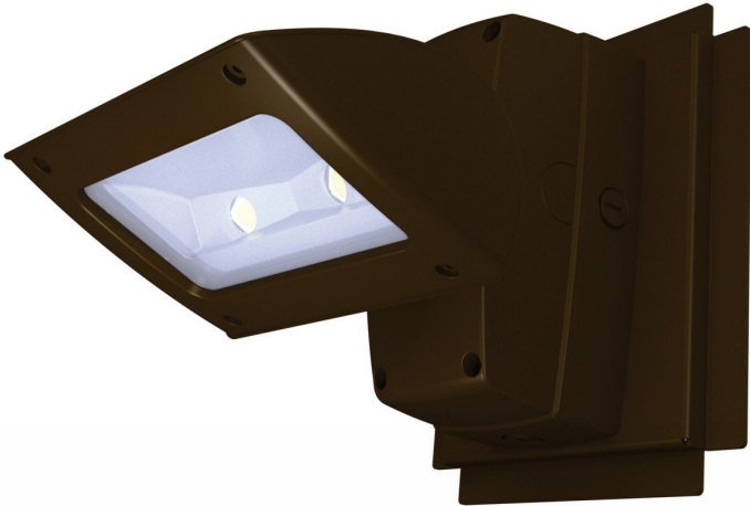
VEK-LED with Goof Tray