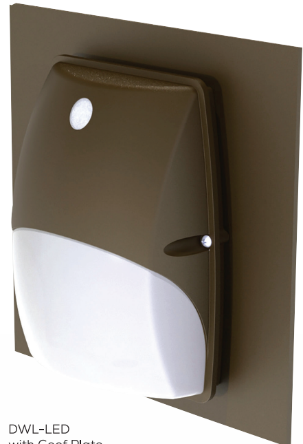
DWL-LED with Goof Plate