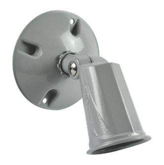
R101 (Single Holder and Mounting Cover)