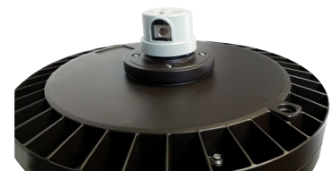
Shown with Photocell