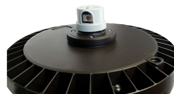
Shown with Photocell