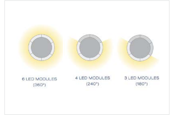
Various beam configurations.