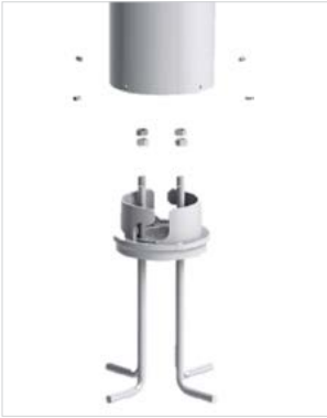
Custom designed twist lock mechanism.