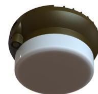
Shown with a Frosted Lens