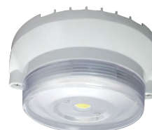
Shown with a White Finish