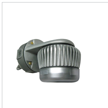
DVBKS-LED Wall mount