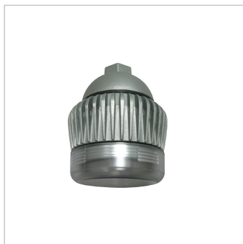
DVCs-LED Pendant mount