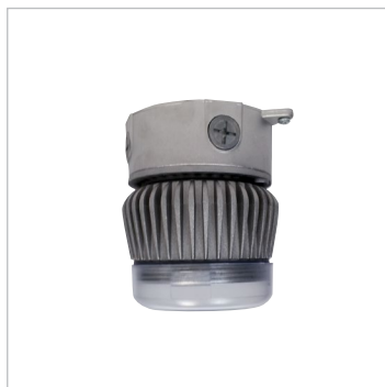
DVAKS-LED Wall mount