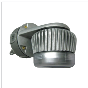
DVBSK-LED Wall mount