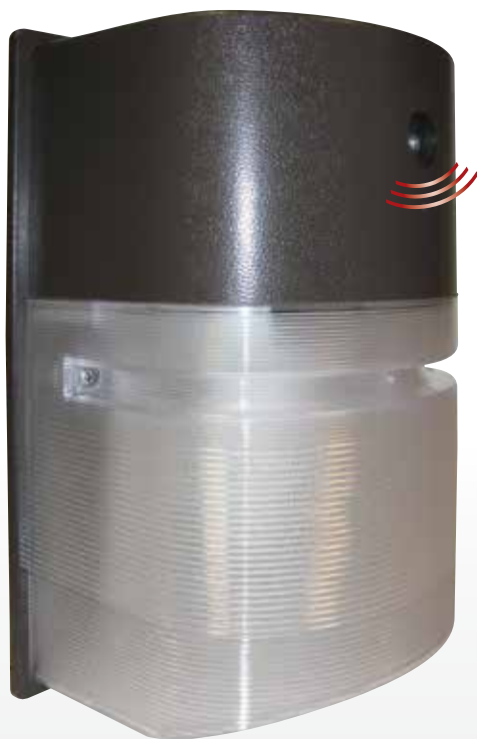
WALL LIGHT WLR